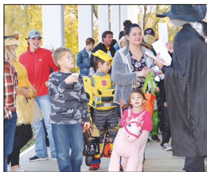
Local businesses and other groups handed out candy to hundreds of kids at the ever-popular Halloween at the Courthouse event on Nov. 1.