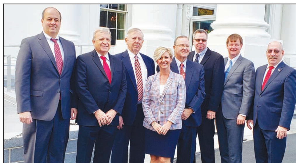
All eight Georgia sole commissioners in one place at the White House in Washington, D.C.